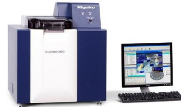
X-Ray Fluorescent Spectrometer Detection of Heavy Metals through the measurement of characteristic secondary x-rays from a sample that has been excited by bombarding with gamma rays